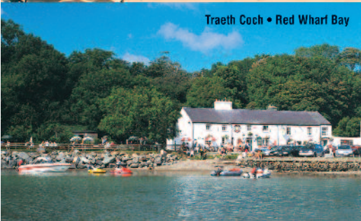
Traeth Coch • Red Wharf Bay